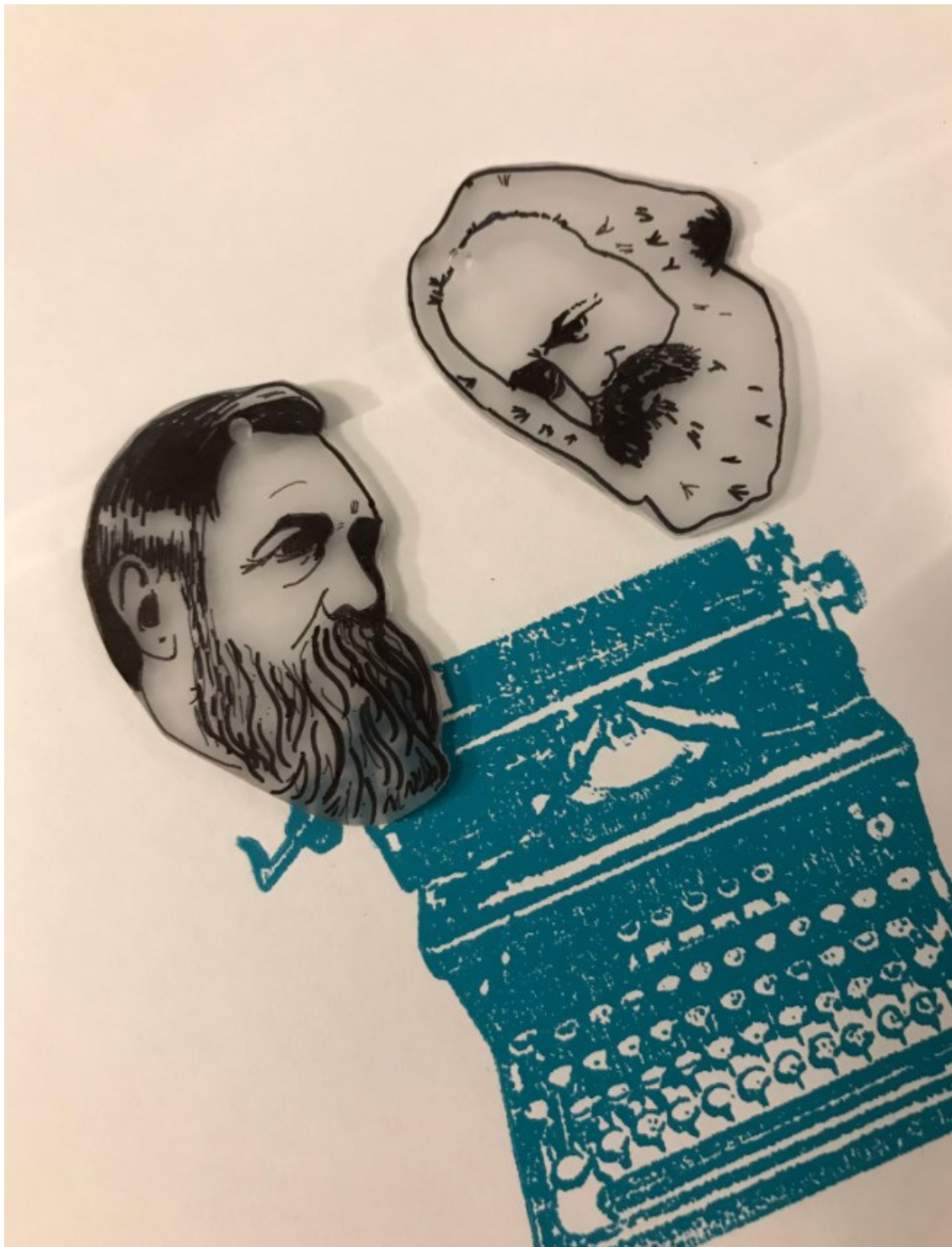
“ Two Heads & A Typewriter” a Collage by M.S. Evans © 2021